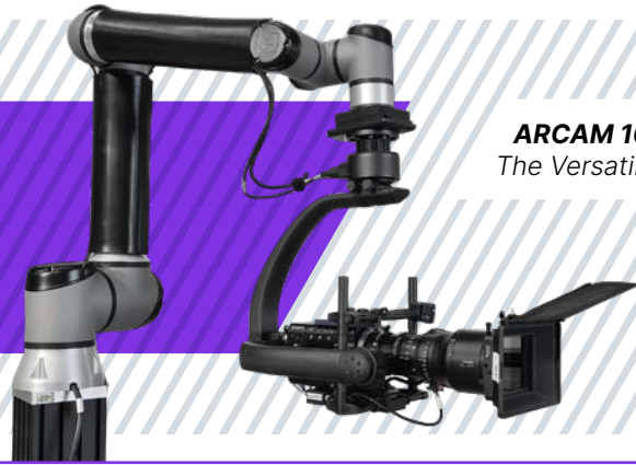
ARCAM 10: The Versatile Studio Workhorse

Precision Robotics for Every Creative Vision